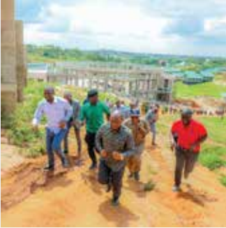
Site Visit by Hon. Albert Chalarnila Regional Commissioner Dsm