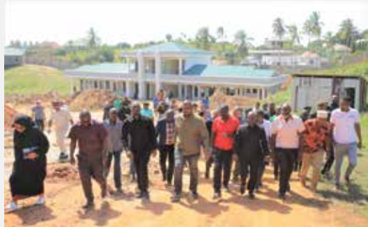
Site Visit by Hon. Deogratius John Ndemaji Former Deputy Minister OR-Tamisemi