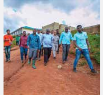
Site Visit by Hon. Amos Makala Former Regional Commissioner DSM